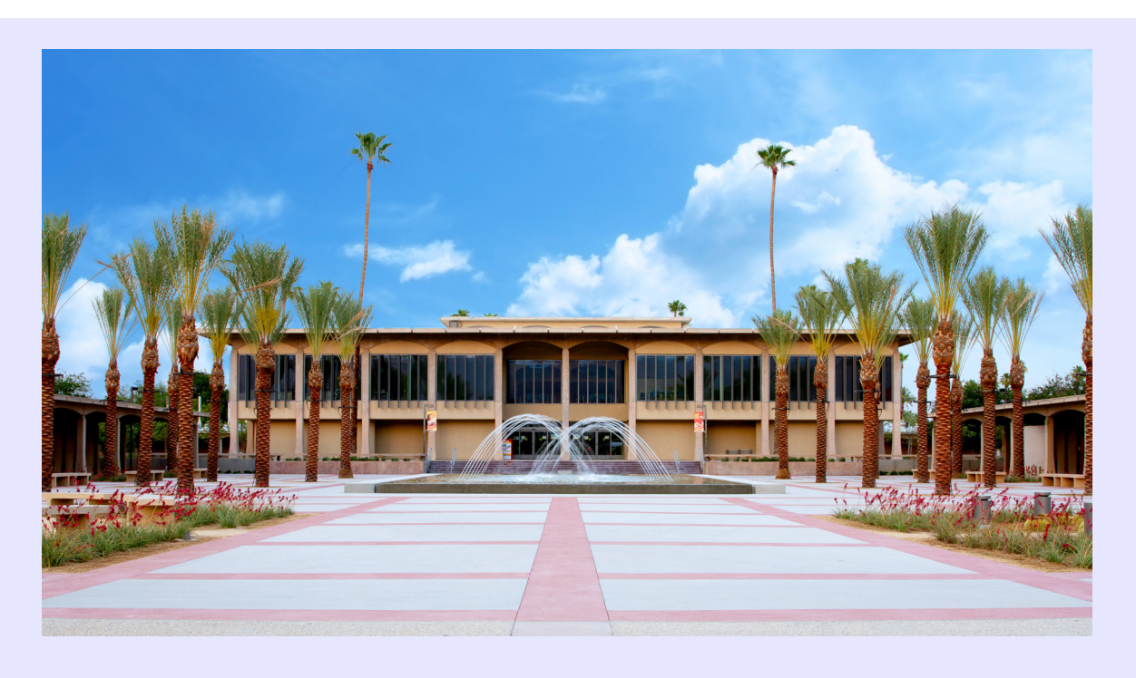
Tuesday, January 4 - Tuesday, January 25, 2022 Classes Meet Monday - Friday

***ALL FEES, HOURS, LOCATIONS AND DATES SUBJECT TO CHANGE WITHOUT NOTICE*** Please check the College of the Desert Website for changes.