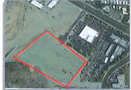
Aerial of Site