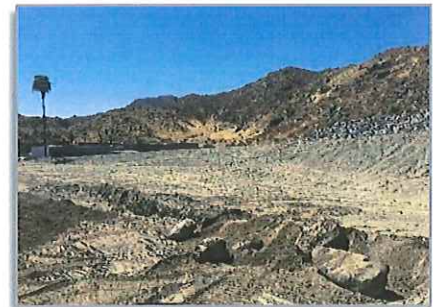
Existing Undeveloped Site