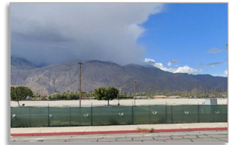
Existing Undeveloped Site