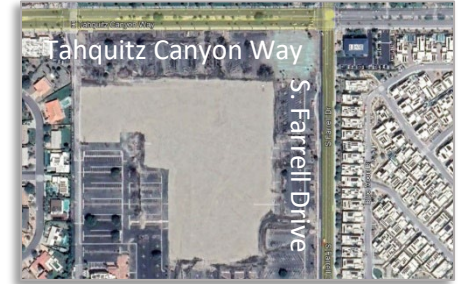
Aerial of Site

The planning and development of a new campus on approximately 27 acres of reclaimed land in Palm Springs. The campus will accommodate a combination of traditional instruction methodologies and hands-on technical education. Informed by industry partners and local stakeholders, the campus will establish and augment signature programs including Hospitality and Culinary Arts, Digital Media and Media Production, Radio, Health, and Sustainable Technologies. To accommodate these programs, Phase 1 of the project includes construction of an education Accelerator containing flexible classrooms, meeting spaces, student services, maker spaces, and high-tech learning laboratories. Future phases on the 27-acre site have yet to be decided.