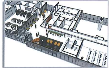
Lobby Renovation & Cyber Lab