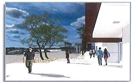
Perforated Metal at New Lobby