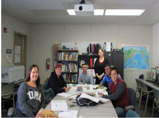
Instructional Support Specialist assisting ACES Students with study materials in the computer lab.