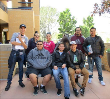
ACES Students enjoying a Campus Tour of UC Irvine