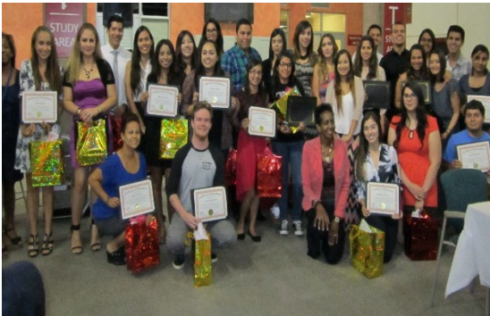
ACES Graduation and Transfer Ceremony